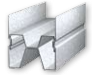
ProX Header w/ Insert